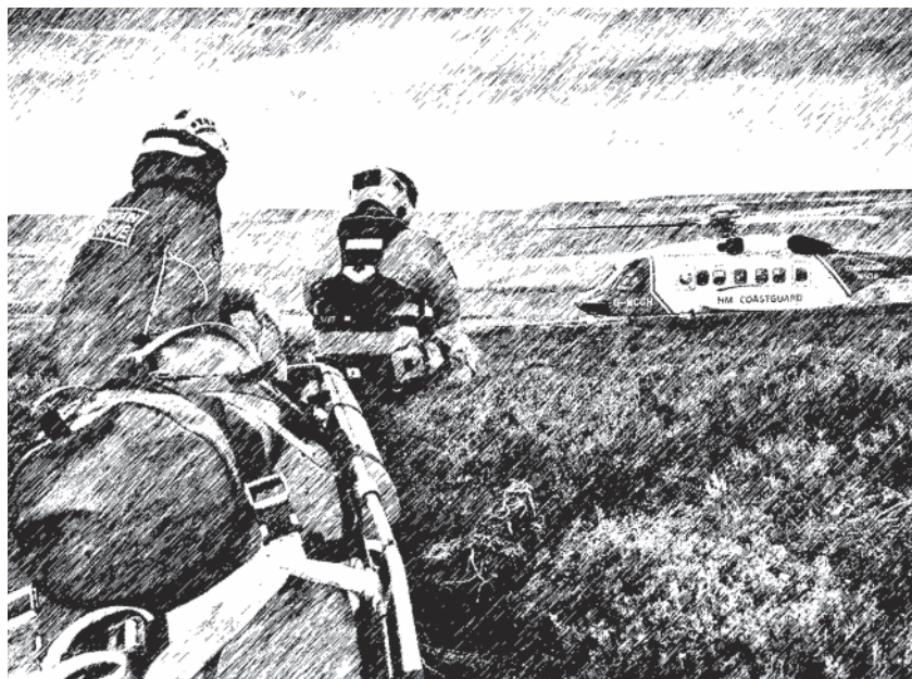
Above: Woodhead team members await a helicopter evacuation for a casualty © Woodhead MRT.

could be a sign that person needs extra help. We all deal with stress in different ways. Some talk it through, some bottle it up, some head to the hills to blow the cobwebs away, others take to the yoga mat. We've included some of the signs and symptoms in the panel below. You will know better than anyone how your loved one is coping with those emotions. Sometimes it can be hard to articulate how we're feeling with those closest to us, but there is help available to help you and your family if you need it.