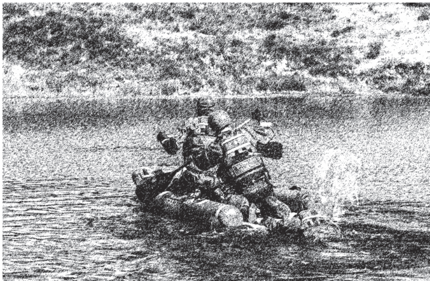
Previous page: Buxton team members during filming for BBC's Blue Peter. Above: Exmoor team members water training in Pinkery Pond during July 2018.

and heavy snow with team members supporting their local communities (and often further afield) and the statutory emergency services with their expertise and organisational skills during extreme conditions.