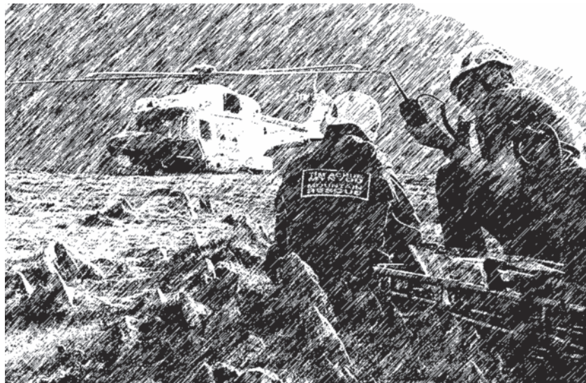
Above: Ogwen Valley MRO team members wait to load the casualty onto the helicopter © OVMRO.

There are a number of ways you can prepare your kids for the uncertainty of