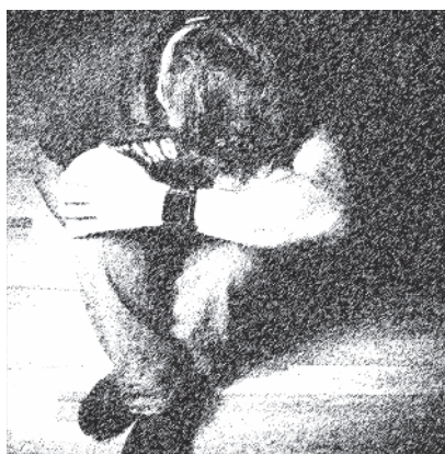
Above: Being a mountain rescue volunteer can be high risk and highly stressful but help is at hand if you need it.

Your volunteer may show signs of heightened stress after a call-out, perhaps appearing 'wired', exhausted or just low in mood. These can all be part of a normal stress response but if symptoms persist for some time, they